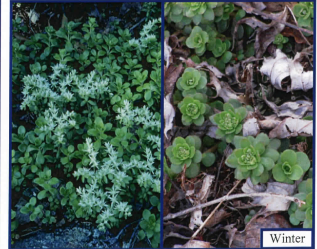
Mountain Stonecrop Sedum ternatum

This 0.5-2.5 foot tall plant blooms from April to June. It requires moist to wet soil with full to partial sunlight or shade. This long blooming semi-evergreen plant is a prolific spreader.