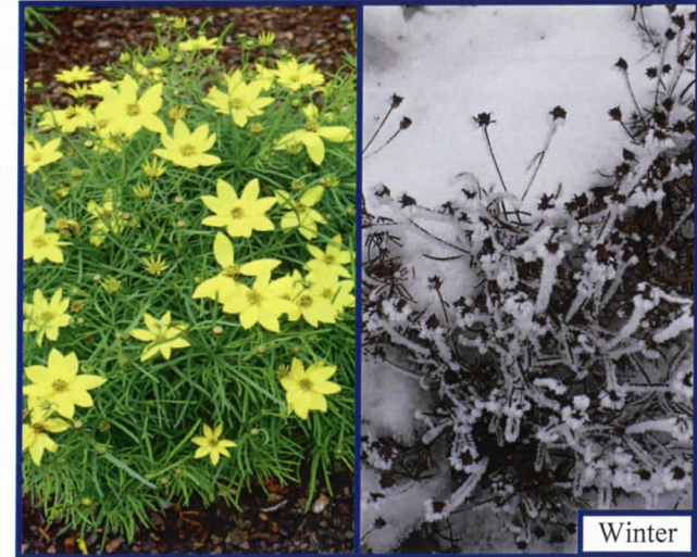
Tickseed Coreopsis Coreopsis verticillata

This 2-3 foot tall grass blooms from July to September. It requires dry to moist soil with full to partial sunlight or shade. Its a very tough hardy grass. "River Mist" is a cultivar that has variegated foliage.