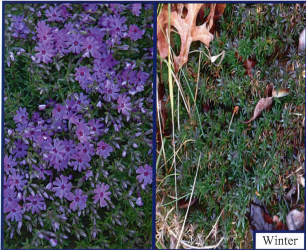
Moss Phlox Phlox subulata

This 2-3 foot tall plant blooms in May. It requires dry to moist soil with full to partial sunlight. It has a pretty yellowish-orange fall color. 'Blue Ice' is a smaller cultivar that reaches a height of 12 -15 inches. This cultivar has a longer blooming flower that's more vibrant in color than regular Bluestar.