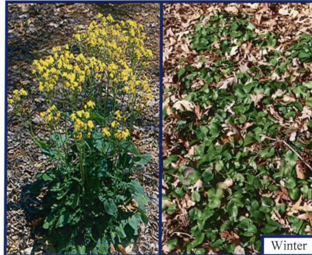
Golden Groundsel Packera aureus or Senecio aureus

This 0.5-1 tall semi-evergreen groundcover blooms from March to June. It requires dry to moist soil with full to partial sunlight or shade. In moist soil this plant will bloom intermittently until the end of summer.