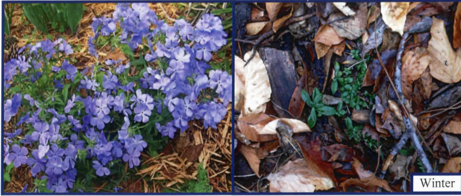
Woodland Phlox Phlox divaricata

This 1.5 foot tall plant blooms from April to June. It requires moist soil with full to partial shade. This plant has aromatic showy flower in spring and then goes dormant in summer. It's semi-evergreen in winter showing only basal leaves. "White Perfume" is a smaller denser cultivar with white flowers.