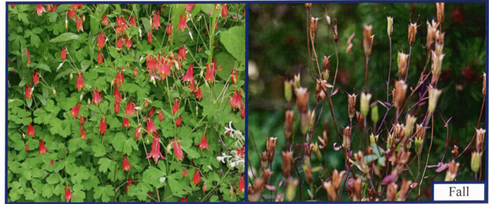
Eastern Columbine Aquilegia canadensis

This 1.5 foot tall plant blooms from April to June. It requires moist soil with full to partial shade. This plant has aromatic showy flower in spring and then goes dormant in summer. It's semi-evergreen in winter showing only basal leaves. "White Perfume" is a smaller denser cultivar with white flowers.