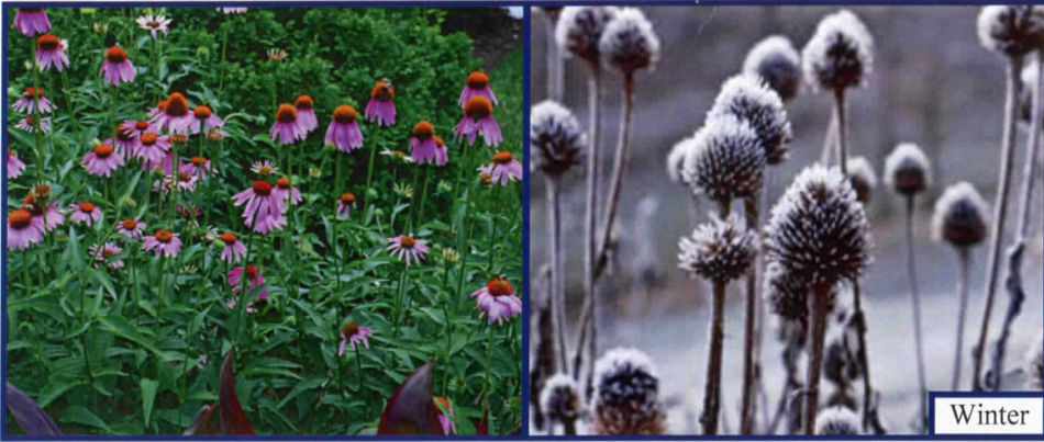
Purple Cone Flower Echinacea purpurea

This 2-3 foot tall plant blooms from June to August. It requires moist soil with full to partial sunlight. Its seed attracts goldfinches in fall. There are over 30 different cultivars of this plant. The cultivars range in size and have flower colors ranging from white to purple. 'Kims Knee High' is a smaller cultivar that reaches a height of 1 -2'.