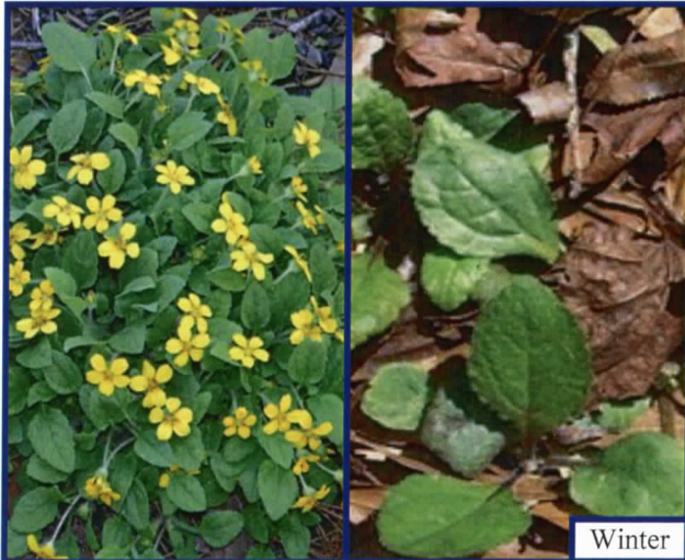
Green and Gold Chrysogonum virginianum

This 0.5-3 foot tall plant blooms mostly in April but flowers can last through July. It requires dry to moist soil with partial shade. This long lived perennial can re-seed and spread throughout the rest of your garden. "Little Lanterns" is a cultivar that is shorter in stature and has a more intense flower color.